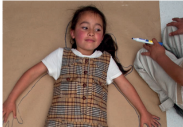
A young girl at school with Fundacion Carvajal

Fundacion Carvajal worked to help children develop the skills to protect themselves against violence by improving their educational performance. It addressed low attainment levels in five schools in Buenaventura by working with 500 children aged 6 to 11. The children engaged in educational reinforcement activities during their half-day outside of school. Sessions at the school promoted principles such as respect, teamwork, and critical thinking. Activities included creative writing, art, IT, maths, music, dance, drama, and environmental awareness, promoting local culture. This education made a tremendous difference in keeping children off the streets and making productive use of their free time.