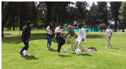
Boys playing at Tiempo de Juego

Since 2013, Children Change Colombia has worked with Tiempo de Juego in Cazucá, Soacha, near Bogotá. Because most schools only operate on a half-day schedule, most children need positive activities to fulfill the rest of their day. That is why Tiempo de Juego runs a project to generate vital skills and positive role models for children through activities like football, dance, and a work creation programme. Today, Tiempo de Juego uses its activities to work against the recruitment of children to armed groups and keep young men and women from being involved in gangs. Their work has helped end the stigma of former child recruits and has helped reintegrate those children into society with the utmost opportunities to succeed.