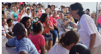
Children Changing Children

In 2016, CCC supported Fundescodes in Buenaventura on Colombia's Pacific coast. Buenaventura was a critical strategic area for the armed actors in Colombia's conflict, and many children were exposed to the violence of the illegal armed groups. Thanks to the support for Children Change Colombia, Fundescodes worked in four of Buenaventura's worst-affected neighborhoods to protect children's rights within their communities and support the children suffering from the conflict. For example, Fundescodes helped one community set up a 'Chapel of Memory' with photographs of community members who have been killed or disappeared by armed groups. These displays of unity and remembrance were peaceful acts of defiance of the fear and hopelessness that has silenced these communities.