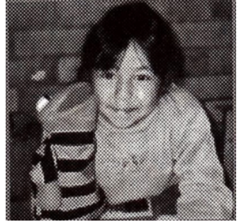
A young girl playing with a puppet at Fe y Alegría

In 1996, in Santa Librada, COTA funded the Fe y Alegría youth centre. The centre provided children with various educational and recreational activities. Fe y Alegría was a peace-building and youth initiative that sought to engage children in gangs in Usme in dance and music. The children practiced many different kinds of artwork, dance, and play to support a healthy lifestyle. By the 2000s, the center implemented rap and breakdance workshops with street gang members.