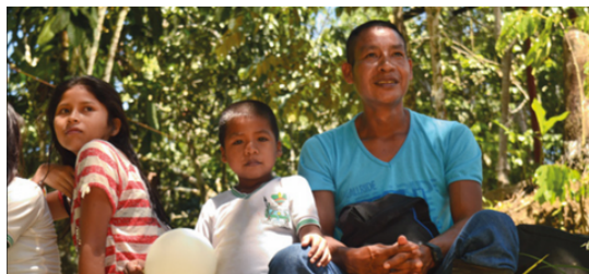
Children of Fundescodes

In 2016, CCC supported Fundescodes in Buenaventura on Colombia's Pacific coast. Buenaventura was a critical strategic area for the armed actors in Colombia's conflict, and many children were exposed to the violence of the illegal armed groups. Thanks to the support for Children Change Colombia, Fundescodes worked in four of Buenaventura's worst-affected neighborhoods to protect children's rights within their communities and support the children suffering from the conflict. For example, Fundescodes helped one community set up a 'Chapel of Memory' with photographs of community members who have been killed or disappeared by armed groups. These displays of unity and remembrance were peaceful acts of defiance of the fear and hopelessness that has silenced these communities.