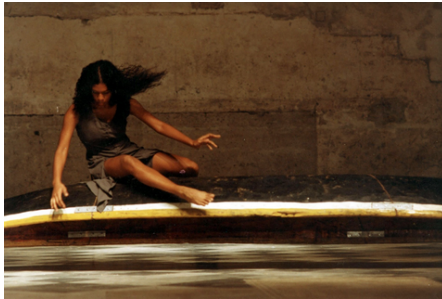
A young dancer at Colegio del Cuerpo

In 2003, Children of the Andes began supporting Colegio del Cuerpo. This social dance project also used dance to help children recover from the trauma of witnessing war, increase their sense of self-worth, and cope with life as displaced young people. The organisation implemented a kind of “Body Education” that combined dance, movement, and education on anatomy, physiology, nutrition, sex, substance abuse, and conflict resolution. This type of education was to help disadvantaged children deal with issues affecting their development. Research showed the programme improved school attendance, behavior, academic performance, and the ability to deal with conflicts.