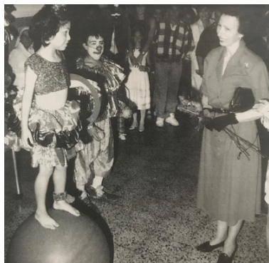
Princess Margaret's visit to Circo Para Todos in 1998

In 1998, COTA began supporting Circo para Todos, a professional circus school based in Cali. The school offered young people living on the street classes in clowning, dance, music, and developed their career opportunities. It was also in 1998 that Princess Anne visited Circo para Todos to support the children of Colombia.