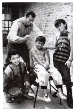
A boy gets his haircut at Subachoque

In 1993 in Subachoque, a country north of Bogotá, COTA purchased land from a successful advertising campaign in Colombia. They opened the Hope centre, a first-stage home for new arrivals capable of helping 70 children detox from drugs. Here, the children worked on the farm and learned trades that would be useful after rehabilitation. The site worked with children on repair (to home and family life) and detoxification (from solvent abuse) before going to Cajica.