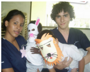
Activities at the Fundamor Foundation

Children of the Andes began supporting the Fundamor Foundation in 2004. The organisation had provided support to orphaned and abandoned children with HIV/AIDS since 1992. They provided medical, educational, and emotional support to those children affected by the disease.