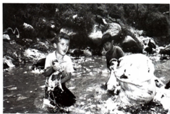
A boy collects trash in the river

In Manizales, Alberto Jaramillo ran a development programme in the municipal dump where entire families scratched a living from the municipal landfill, only earning 50 pesos a day. The development sought to help families learn various income-generating activities and thus not depend on the dump for income. Thanks to Children of the Andes, the nearest school was extended, and many children were fed there daily.