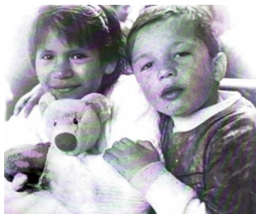
Children at Cedavida

COTA also continued to support children affected by war with the organisation Cedavida. The goal of this organisation was to help families displaced by conflict start a new life. In 1997, COTA dealt with Colombia's "Dirty War," where two left-wing guerrilla armies fought the Colombian government in Bogotá.