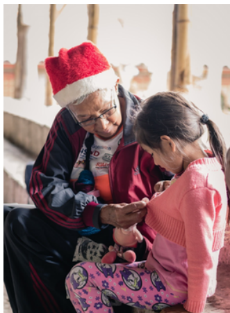
CRAN activities over the holidays

Children Change Colombia has worked with Fundación CRAN since 2015 to effectively reintegrate children and young people who have been part of illegal armed groups (including FARC) into civilian life.