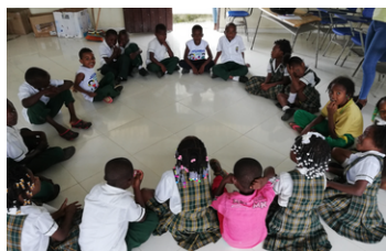
Students of Acedesan

Since 2019, CCC supported the promotion of a healthy education for the Afro-Colombian children of the pacific region. Located in an isolated area of Colombia, this project works in four schools, where 80 children participate in Acedesan's development of a new school curriculum that does away with traditional learning-by-rote teaching and instead makes lessons fun and participative.