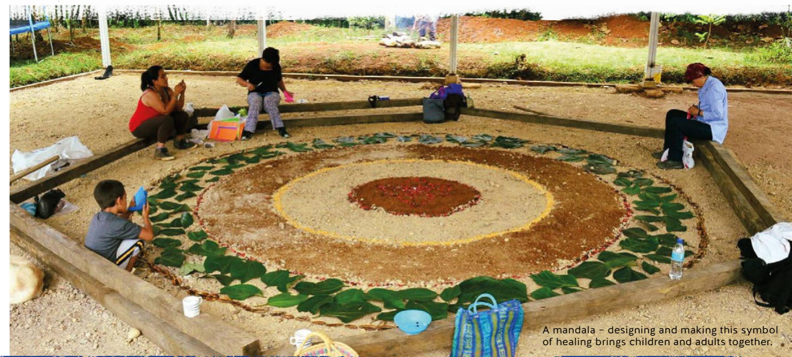
A mandala – designing and making this symbol of healing brings children and adults together.