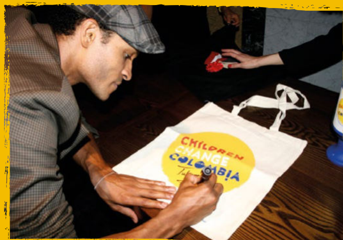
*Which you can visit on our 2018 CCC Tour of Colombia (see page 5)

We can't thank Fernando, or you, enough.