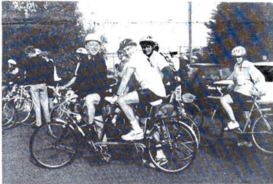
A bicycle made for two! Some participants in the Dublin to Kilkenny Cycle.