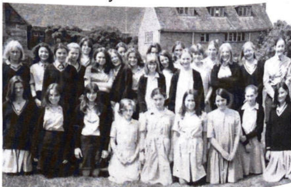
Form 8Y, Stratford-on-Avon Grammar School for Girls 'Top of the Pops' cast

In 1993, 97% of our funds came from individuals and groups - only 3% from companies or trusts and we do not as yet receive any Governmental aid. This is unusual for a charity and illustrates just how much we rely on our individual and group donors. To all of you, many still continuing to support us since our foundation, a heartfelt thank-you.