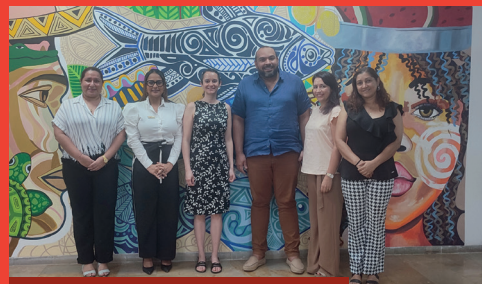
New Partnerships with Universidad del Sinú Cartagena